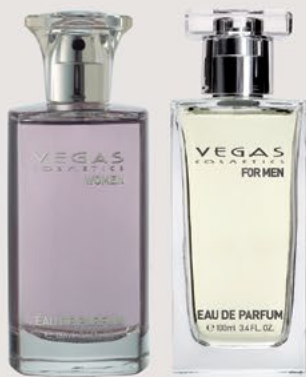
FOR HER FOR HIM 100ML | CODE 100

Vegas perfume leaves a virtually unforgettable personal mark. With its pleasant notes, it acts in every way.