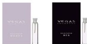
SAMPLE | 2ML | CODE 9051 WOMAN MAN