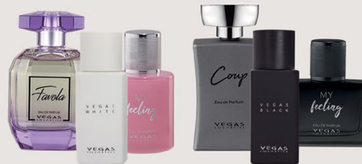
FOR HER FOR HIM FAVOLA | 100ML | CODE 130 COUP | 100ML | CODE 131 VEGAS WHITE | 50ML | CODE 140 VEGAS BLACK | 50ML | CODE 139 MY FEELING WOMAN | 50ML | CODE 134 MY FEELING MAN | 50ML | CODE 135

The subtle touch of Premium fragrances, combined with the powerful sense of smell, have the ability to mark moments and make life more complete.