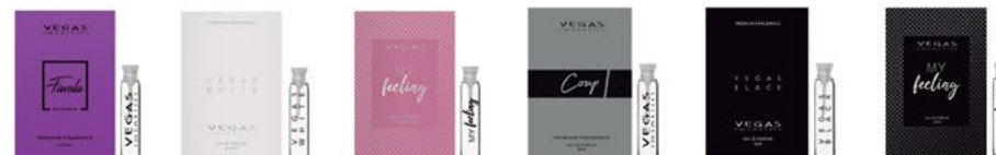
SAMPLE | 2ML | CODE 9051 FAVOLA COUP VEGAS WHITE VEGAS BLACK MY FEELING WOMAN MY FEELING MAN